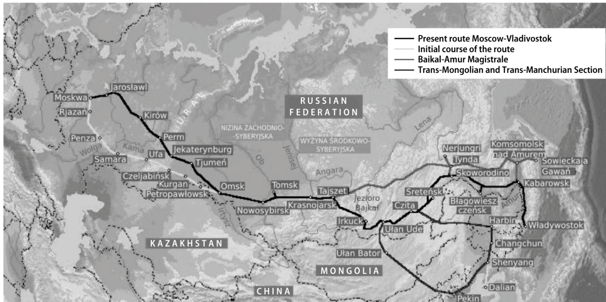
Fig. 1. The route of The Trans-Siberian Railway.