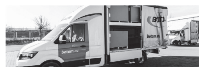
Fig. 3. Double floor in a vehicle with a GVM <3.5 t

significant innovation in the TFL industry. The carrier specializes in international transport of goods with vehicles with a GVM of less than 3.5 tons, with about 30 vehicles in its fleet. The key element in the analysis of the phenomenon seems to be the fragment referring to the double floor, placed on the carrier's website: "customers expect strong personalization of services. It must be adapted to the needs of the transported load, as well as it will meet the criteria of cost optimization and shortening the time of its implementation" <sup>10</sup>.