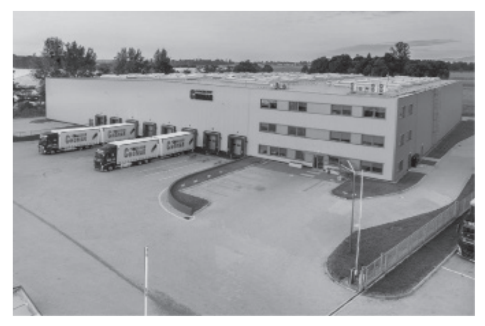
Fig. 5. Logistics base of Chomar Sp. z o.o.

the transport of goods on the international arena<sup>15</sup>. In addition to domestic and international transport, the company also offers maintenance services, i.e. authorized maintenance services from reputable truck manufacturers. In addition, there is a guarded car park 24 hours a day, as well as the possibility of verifying the braking force on the rollers at the service, and the use of a device for measuring the suspension geometry, in addition, the services are complemented by warranty inspections of trailers, such as Wielton, Koegel, Fliegl, or Keassbohrer. The logistic base, along with the storage, are shown in the Fig. below.