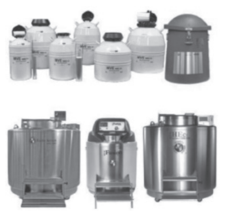
Fig. 4. The outer tank, which has an impact protection character

right questions to answer: how to arrange transport so that it reaches the recipient safely? This, in turn, forces the creation of a group of experts as part of the so-called "emergency shipping". The clinic commissioned the design of the entire transport process, with the rigor of caution in individual steps. The aim was not only to obtain answers to the key questions for the success of the transport, but above all to obtain a reliable partner for years in road and air transport. The dedicated load, on the other hand, was ADR hazardous materials, classified under the number UN 3373 KL 6.2, i.e. biological material, category B. the goods were secured with liquid nitrogen, cooled to the level of - 90 degrees Celsius. The photo below shows the so-called "thermos", which fulfilled the safety function and is classified as an effective storage and transport system, under the so-called cryopreservation, which is the optimal way to keep biological material in the form of frozen particles at relatively low temperatures, most often in liquid nitrogen. <sup>13</sup>.